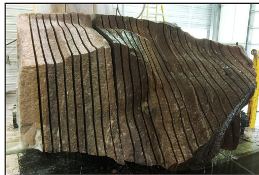
The Sioux Quartzite stone is actively being cut at the quarry in Jasper, MN.